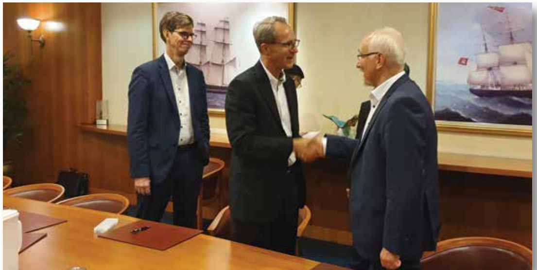
The agreement between Jebsen & Jessen Group and Konecranes was signed on Dec 5, 2019.

Dec 2019 Jebsen & Jessen has signed an agreement to divest our 50% stake in MHE-Demag, our material handling joint venture, to Konecranes. The proceeds will be used entirely to finance our next strategic phase.