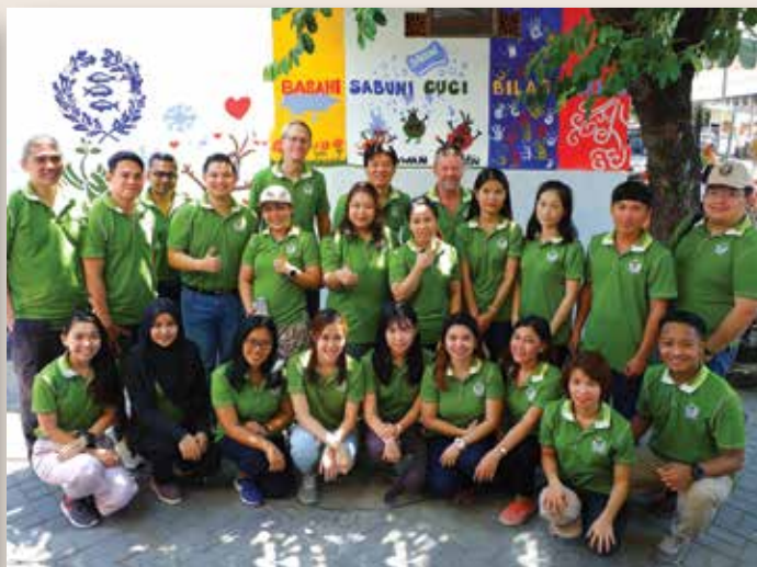
Volunteers from the Meet a Social Need trip to Surabaya, Indonesia.

Oct 2019 Twice a year, teams of Jebsen & Jessen volunteers from all over the region venture into parts of ASEAN that most of them had not heard of, so that they can make a difference in the lives of people they had not met.