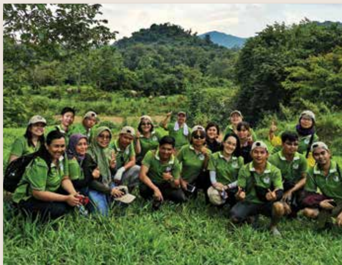
Our green heroes from the Meet a Green Need trip to Kui Buri, Thailand.