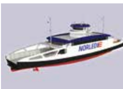
05/Connecting People to Cleaner Energy