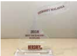
03/Living up to Global Standards