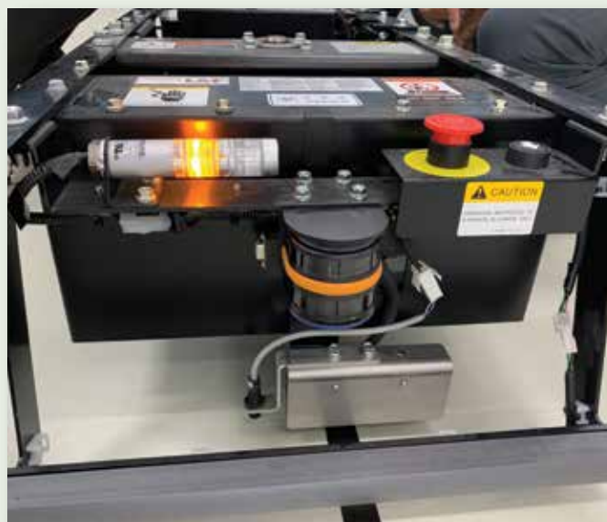
The tailored AGV solution for Sony.

As Sony's AGV system uses magnetic tape on the floor as a guiding line, we proposed to replace this with a sensor-based solution using luminescent tape. The luminescent tape coating is invisible to the human eye but can be tracked by a particular SICK sensor type.