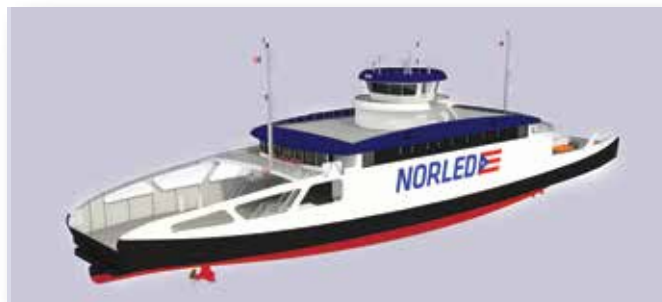
Artist's impression of Norled hybrid plug-in RoPax / Image Courtesy of Sembcorp Marine.

Jul 2019 Cables International has been working closely with customers such as Sembcorp Marine Integrated to grow our presence in the renewable energy sector. In July, Sembcorp Marine Integrated awarded us with a contract to supply two topsides for Ørsted Wind Power as part of the UK's Hornsea 2 Offshore Wind Farm project. The 1.4-gigawatt capacity wind farm will be the world's biggest when it becomes operational in 2022. Just a few months later, in November, we were awarded another contract to supply three roll-on/roll-off, plug-in ropax ferries for Norway's Norled AS project. These highly energy-efficient vessels will operate normally on zero-emissions battery power. When required, they can run on combined battery-diesel hybrid backup modes. These projects add to our track record in the North Sea, which includes the Culzean CPP WHP ULQ platforms, Kraken FPSO, and Catcher FPSO.