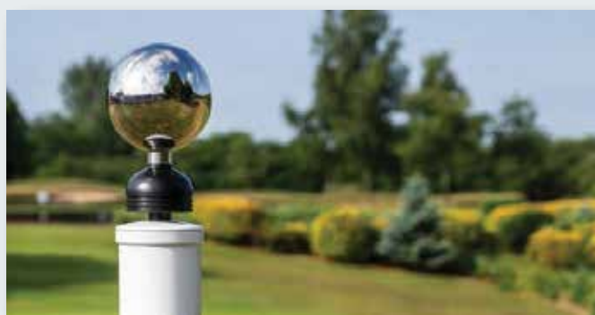
Biral – one of four major brands to join the Jebsen & Jessen Technology family of principals.

"We are very excited to welcome these four new principals to our family and to offer their high-quality solutions to our customers. By working in partnership with our principals and customers, we are confident of growing with South East Asia."