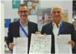
02/A New Distribution Partnership