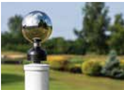
04/Portfolio Growth for Business Growth