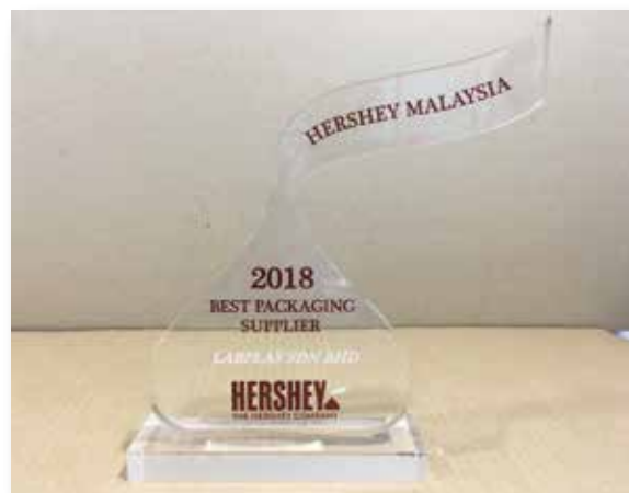
We are proud to be recognised as the 'Best Packaging Supplier of the Year 2018' by the Hershey Company.

Over in Indonesia, JJ-Lapp has successfully recertified our flagship product, the ÖLFLEX CLASSIC 110 and H05V-K and H07V-K, by passing the Germany-based VDE Institute's stringent testing on our first attempt.